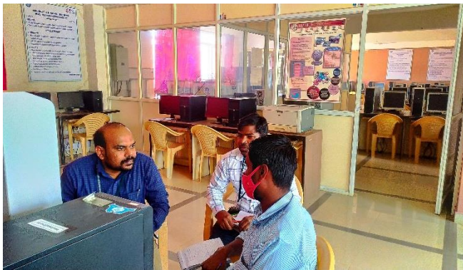
Train the Trainer Program for Faculty - FANUC