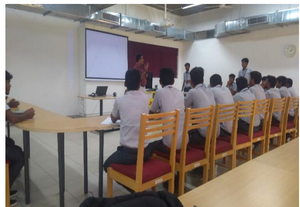
FANUC General Manager - Interact with our Students