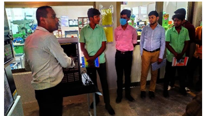
Students - Training