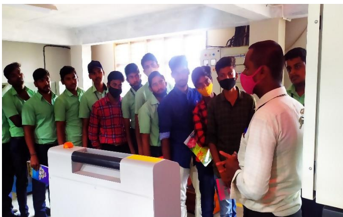
Students - Training