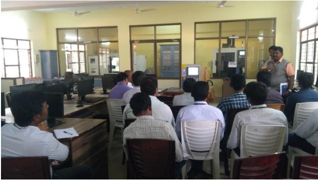
FANUC Faculty Training