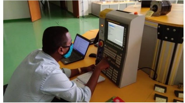
FANUC Faculty Training at Bangalore